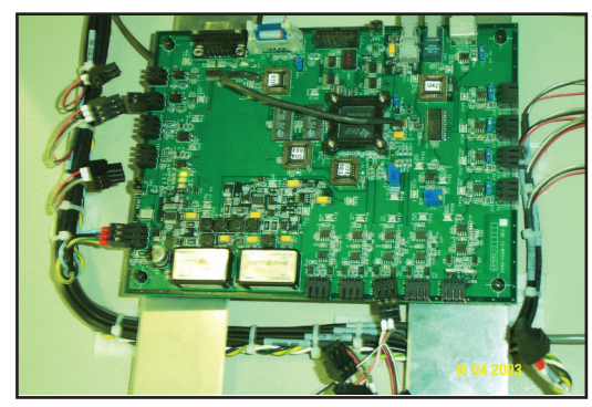
Low voltage board.