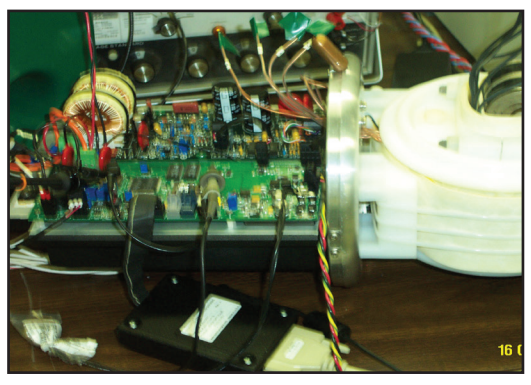
High voltage board.

By using Embed to model parts of the machine, Gottschalk could quickly determine proper sizing of inductors and capacitors before working on any actual hardware prototype. This proved to be much less expensive than working with hardware prototypes.