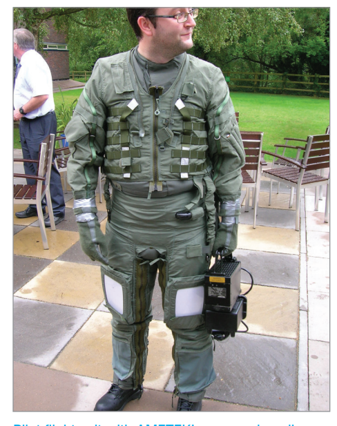
Pilot flight suit with AMETEK's personal cooling unit (PCU).

AMETEK, Inc. 1100 Cassatt Road, Berwyn, PA, United States, 19312 www.ametek.com